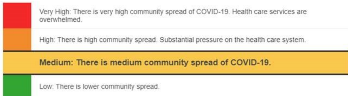
Table: NYC Health • Source: COVID-19 Transmission levels in NYC

NYC has moved from a “low” to “medium” COVID alert level, and has provided the following guidance: